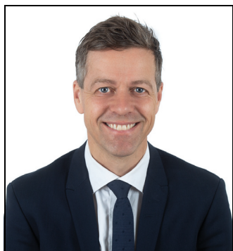
Figure 0.1 Knut Arild Hareide Minister of Transport

Transport is first and foremost about people – about travelling safely and efficiently together. In a country like Norway, with its extensive coastline, high mountains and long fjords, we need to connect urban and rural areas and the people who live there.