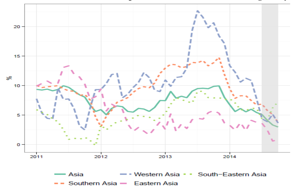
Chart 3: Food consumer price inflation – Asia and sub-regions (y-o-y)

Region and country-specific factors are, therefore, essential in explaining food inflation trends. Consumer inflation in China was particularly tame in the past few months, due to a slowdown in economic growth and persistent overcapacity in the industrial sector. Figures released recently by the National Bureau of Statistics indicate that inflation in China reached a four-year low of 1.6% in September. Food inflation followed the same trend as general inflation: in the eight months up to August 2014, food prices rose at an average pace of 3.4% year-over-year, compared to 4.2% for the same period of 2013. In August, pork prices, a big component of the food index, declined by 3.1%, while vegetable prices dipped 6.9%, dragging down food inflation.