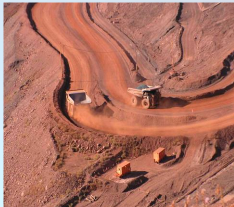
BHP Billiton iron ore operations at Mount Whaleback, Australia

The review on iron ore market developments (140 pages) is recognized as the most authoritative source of information on the iron ore market. The Report contains detailed reviews and data on iron ore production, trade, freight rates and prices, as well as an outlook for the eighteen months ahead.