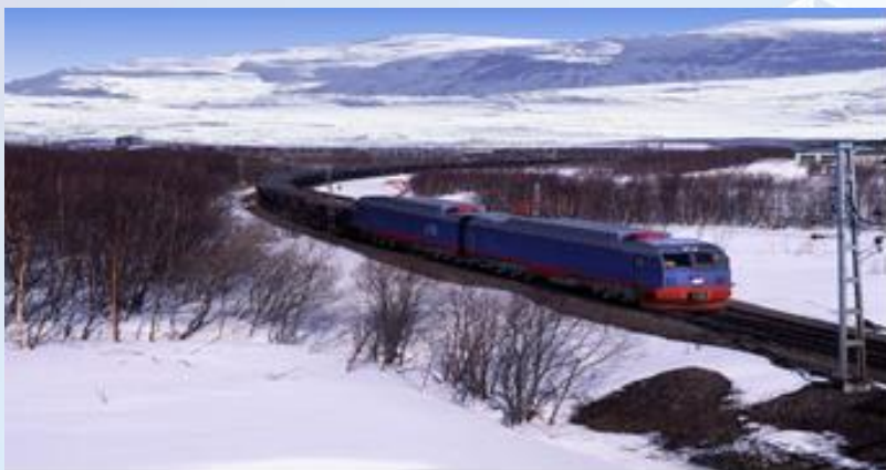
Transporting iron ore through Sweden

Contact information: For more information about UNCTAD iron ore publications please visit UNCTAD.ORG/commodities/iron ore (UNCTAD's IRON ORE project website) or write to ironore1@unctad.org .