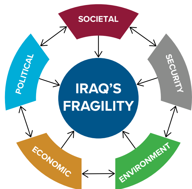
Figure 1: The multidimensionality of Fragility in Iraq