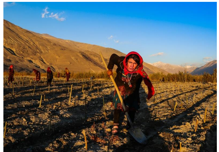
Women working in the fields, UNDP Afghanistan

Violent conflict and external shocks like disasters, health pandemics or global financial crisis can derail and reverse decades of development progress. Climate change, disaster and economic volatility can also exacerbate existing tensions or inequalities, rendering marginalized groups, including women and children, even more vulnerable to shocks. And while systems and institutions in fragile situations are still grappling with the means to mitigate the impact, violent conflict weakens social fabric, polarizes the political environment, damages the legitimacy of government institutions and threatens livelihoods. The following lessons on SDG implementation from the VNRs in fragile and conflict-affected settings have emerged four years into the 2030 Agenda: