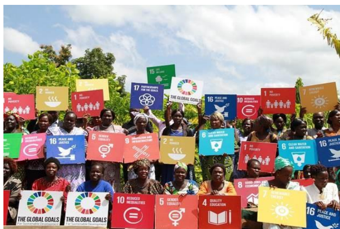
SDG Workshop, UNDP South Sudan

Across all VNRs, the importance of government leadership and of strengthening government capacities to coordinate, plan, communicate and implement the 2030 Agenda was mentioned. Technical capacity in the public sector needs to be strengthened and limited capacity can impede SDG-aligned planning, budgeting and implementation – especially in connecting national, subregional and local government planning, as stated in the VNR of the Central African Republic. In addition, fragile countries often face an acute absence of quality data and analysis, which poses serious constraints to timely monitoring, policy development and targeting interventions where most needed. Togo highlights in its VNR that national statistical institutions lack capacities to address new challenges, which leads to poor monitoring and inadequate setting of indicators. This is echoed in the VNRs from Timor-Leste and Sierra Leone: While improvements in national statistical capacity have been made, producing and analysing high-quality, timely and reliable data for national reporting on SDGs remain difficult and pricey. Progress has been made to disaggregate data , but more investment is needed to ensure all data can be disaggregated by income, gender, age, migratory status, disability, social grouping and geographic location.