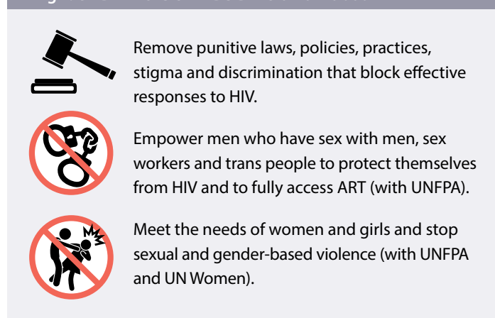
Fig 2: UNDP in the UNAIDS Division of Labour

Grounded in its comparative advantage as a development actor working multi-sectorally, UNDP is a convener/co-convener of outcome areas on human rights, enabling legal environments, key populations, women and girls and gender-based violence under the UNAIDS Division of Labour (Fig. 2). 9 As a founding cosponsor of UNAIDS, UNDP supports countries to ensure that sectors beyond health are engaged in HIV responses, and that action on HIV leverages progress across Agenda 2030. At country level, UNDP has a unique capacity to convene national stakeholders across sectors, including civil society and key populations, and to support policy development and programmes, including in its role supporting the implementation of Global Fund grants and providing implementation support to other health programmes.