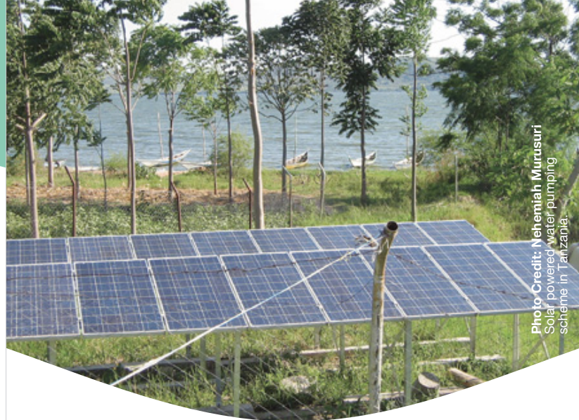
Solar powered water-pumping scheme in Tanzania.