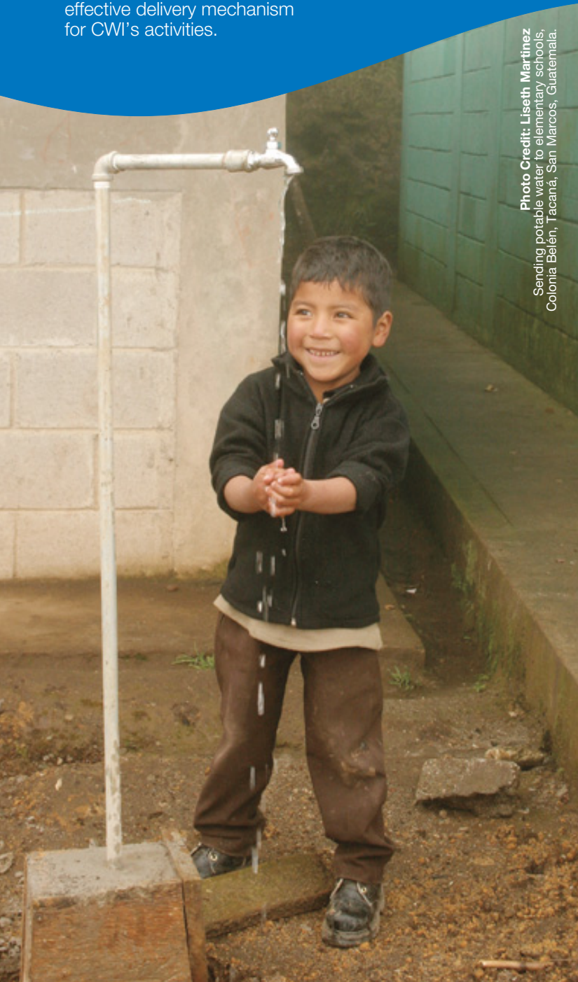
Sending potable water to elementary schools, Colonia Belén, Tacaná, San Marcos, Guatemala.

CWI is implemented through the GEF-SGP, a well-established and proven mechanism for reaching communities and supporting their initiatives. Launched in 1992, it has channeled nearly $300 million to communities through 10,977 projects around the world. SGP has resulted in direct global environmental benefits, and influenced the formulation of national and local policies on sustainable environmental and development management. Building on its success to date, SGP expects to expand to cover more than 120 developing countries by 2010. The rich community-based experience and networking of GEF-SGP have provided an effective delivery mechanism for CWI's activities.