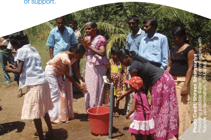
Providing potable water to communities with fluoride contamination, Sri Lanka.

CWI supports decentralized, demand-driven, innovative, low-cost, and community-based water resource management and water supply and sanitation projects in rural areas. It is rooted in the strong belief that local management and community initiatives play a key role in ensuring and sustaining the success of enhancing water supply and sanitation services to poor communities. CWI channels funds directly to local communities in need of support.