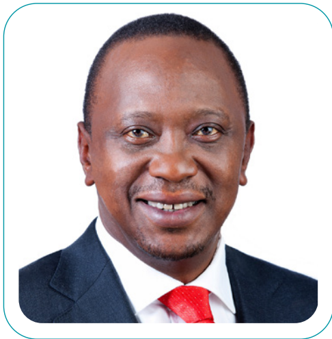
H. E. Hon. Uhuru Kenyatta, CGH

President of the Republic of Kenya and Coordinator (2022-2024), Committee of the African Heads of State and Government on Climate Change (CAHOSCC)