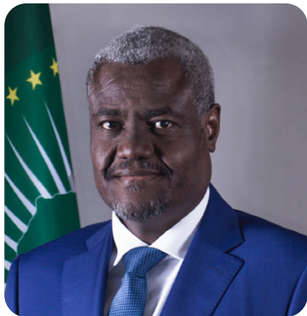
H.E. Moussa Faki Mahamat Chairperson African Union Commission

Climate change is an existential threat to Africa's communities, ecosystems and economies. It places our developmental gains, our prosperity and the aspirations of Agenda 2063 in jeopardy. It is a critical issue that every African has to deal with on a daily basis, albeit in differentiated ways. We must respond, collectively and boldly, to the cross-scale challenges presented by climate change. Partnerships are critical to an effective African climate response, and such partnerships will need to span ministries, sectors, public and private divisions and across regional and national borders. We must work together, both within Africa and with our international partners, not only in addressing the threats posed by climate change, but also in leveraging the opportunities of a just, inclusive and equitable transition to an African green economy.