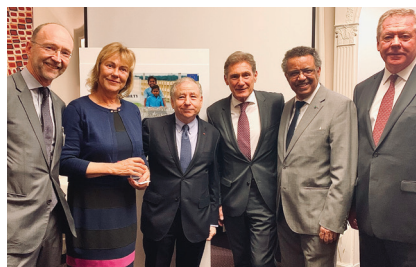
2019 Call for Proposals