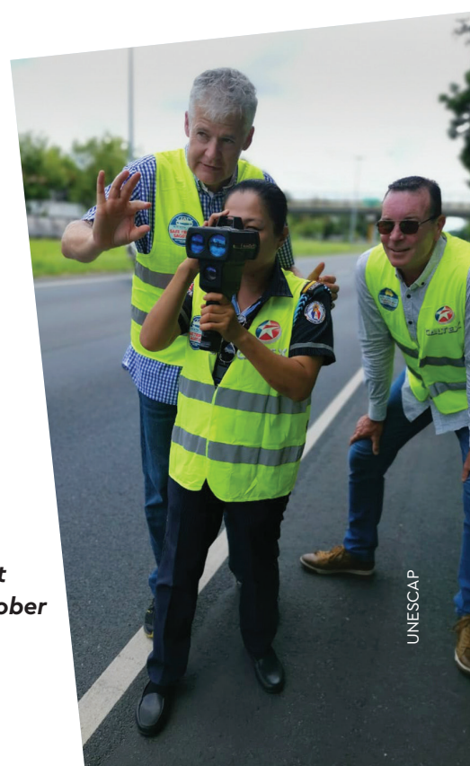
Speed management training on 7-8 October in the Philippines

The ToT training focused on speed enforcement key principles and enforcements in real traffic situations with different technical devices, practical measurement procedure, and mitigation tactics. The next scheduled activity will be the follow-up with the trainers on speed enforcement which is scheduled for the end of 2019.