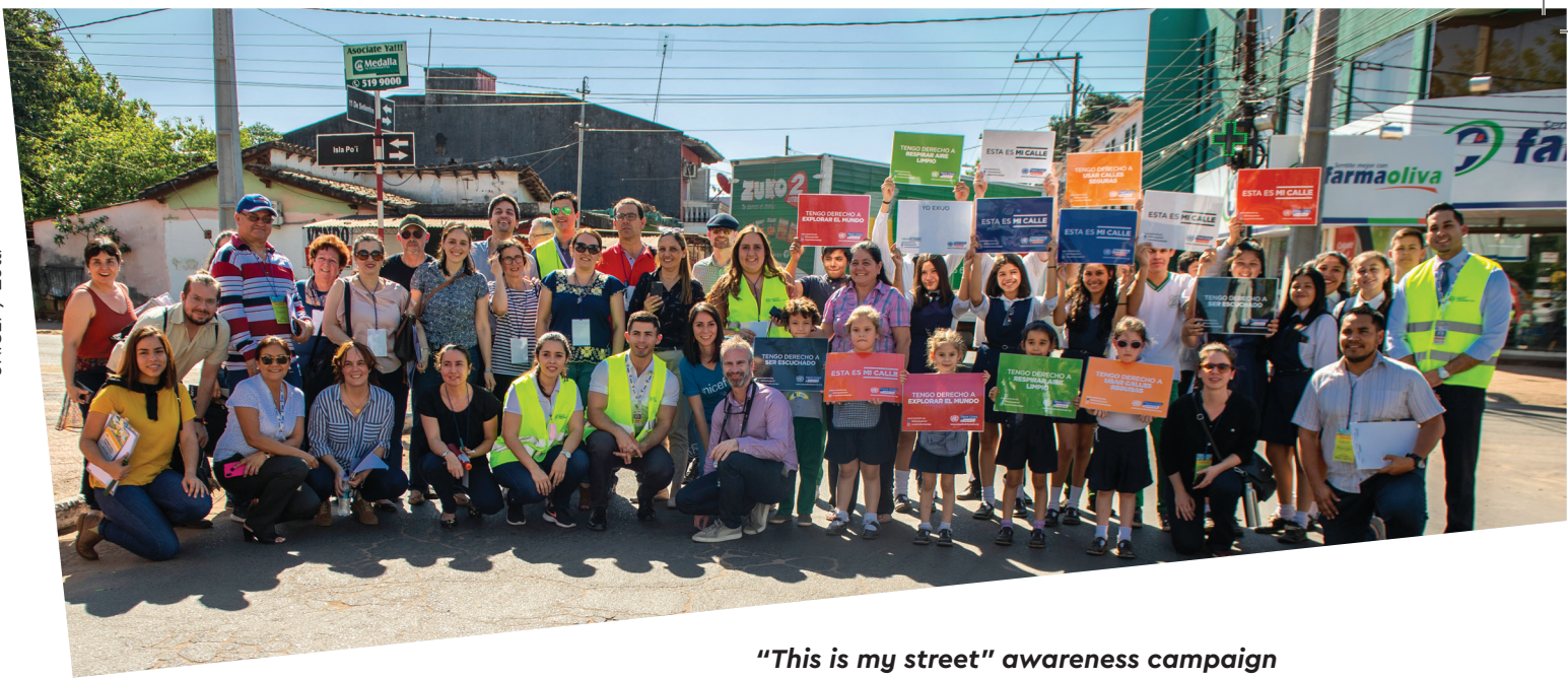
"This is my street" awareness campaign with children on safe journeys to school on 24 October in Fernando de la Mora