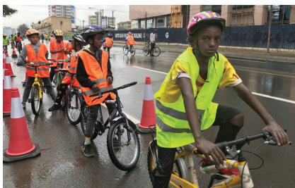
Our work on the ground