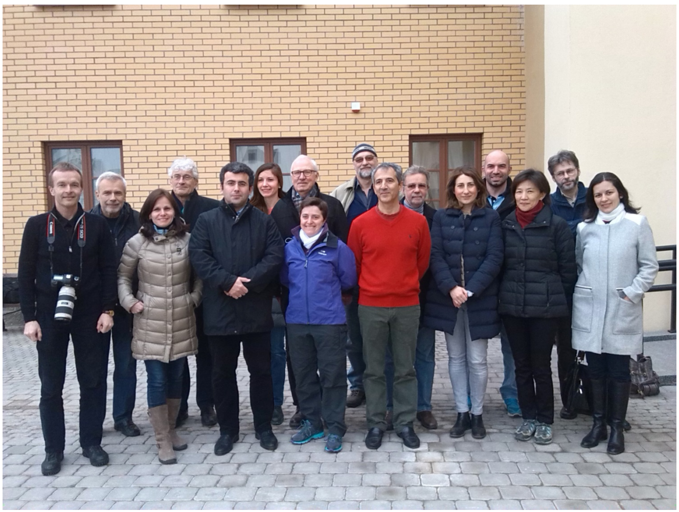
Team for the third EPR of Belarus, 2015