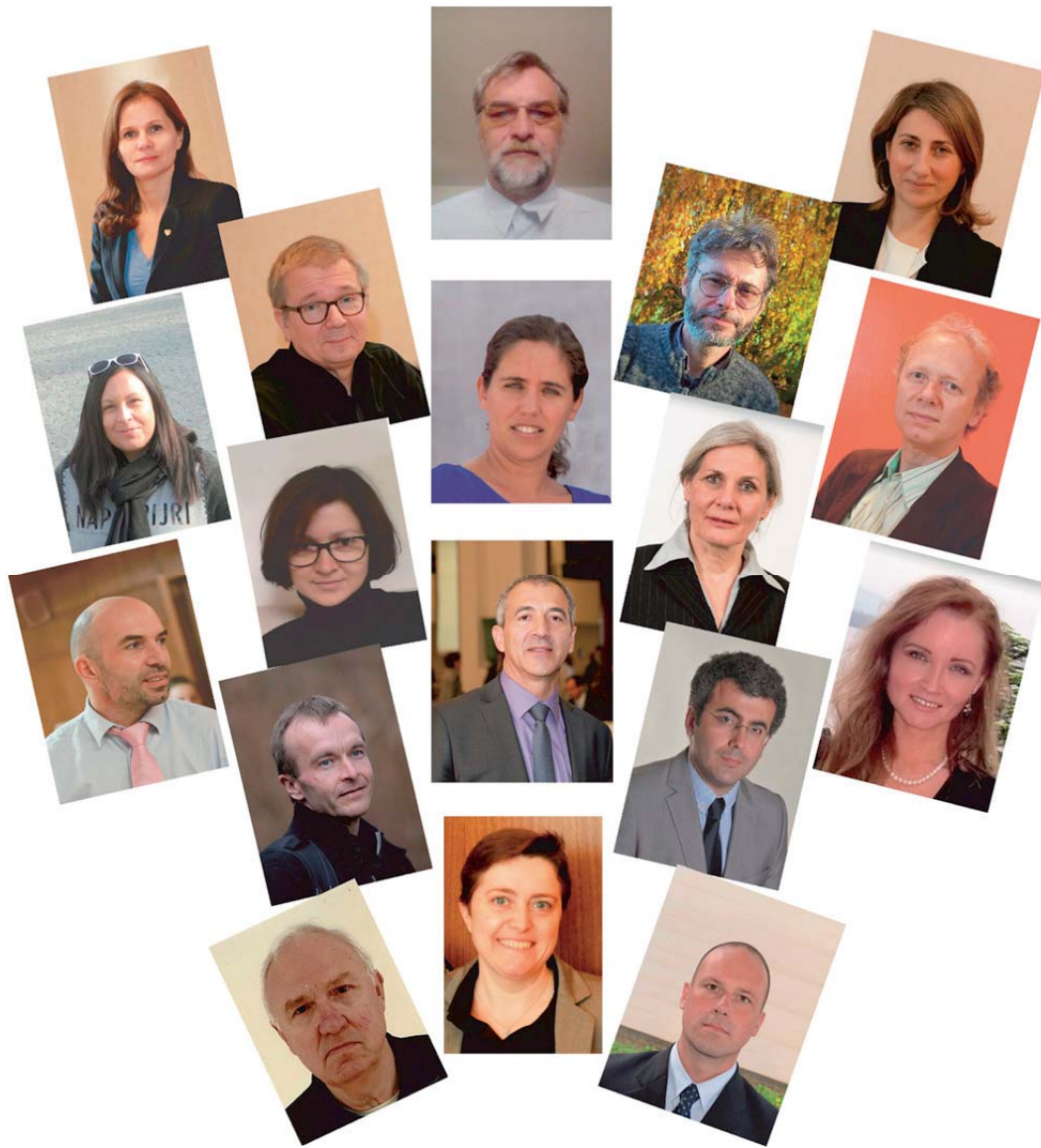
Team for the third EPR of Georgia, 2014