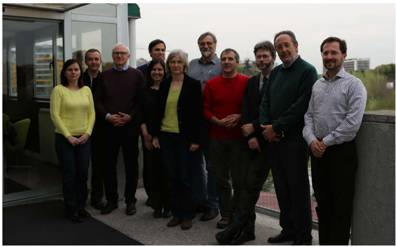
Team of experts for the third EPR of Serbia, 2014