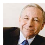
Jean Todt UNRSF Advisory Board Member | United Nations Secretary-General's Special Envoy for Road Safety

“ The establishment of a first-ever United Nations Road Safety Fund is a crucial achievement, marking a substantial momentum in attracting increased global attention, greater political commitment, and willingness to take action towards advancing the cause. ”