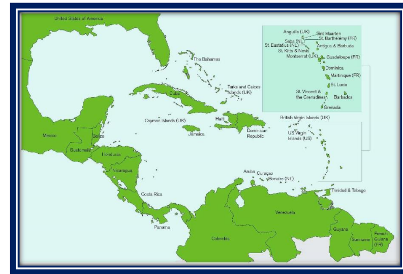
WIDER CARIBBEAN REGION