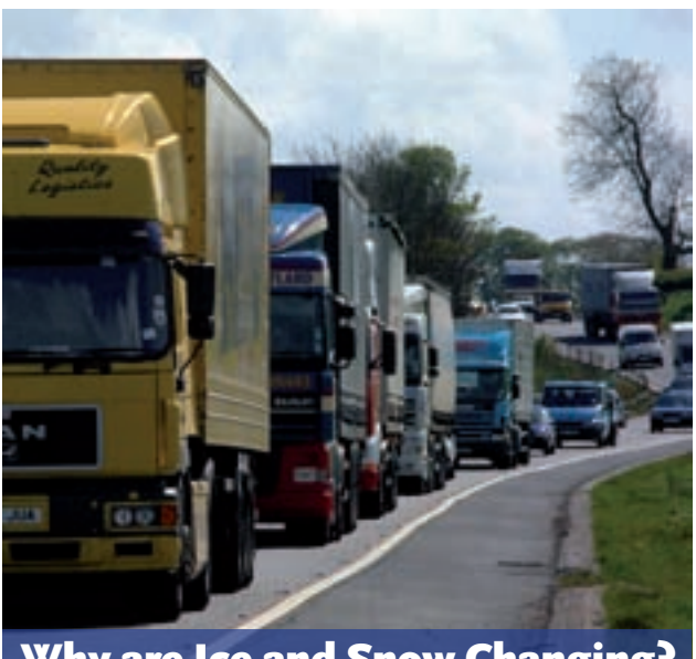
Why are Ice and Snow Changing?