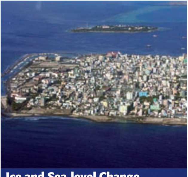
Ice and Sea-level Change