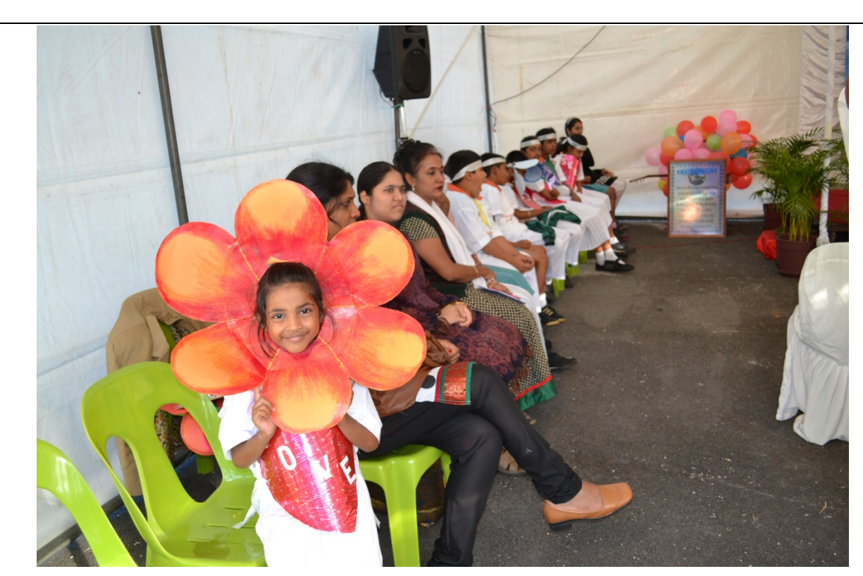
Students of the NGO Indian Ocean Centre for Education in Human Values