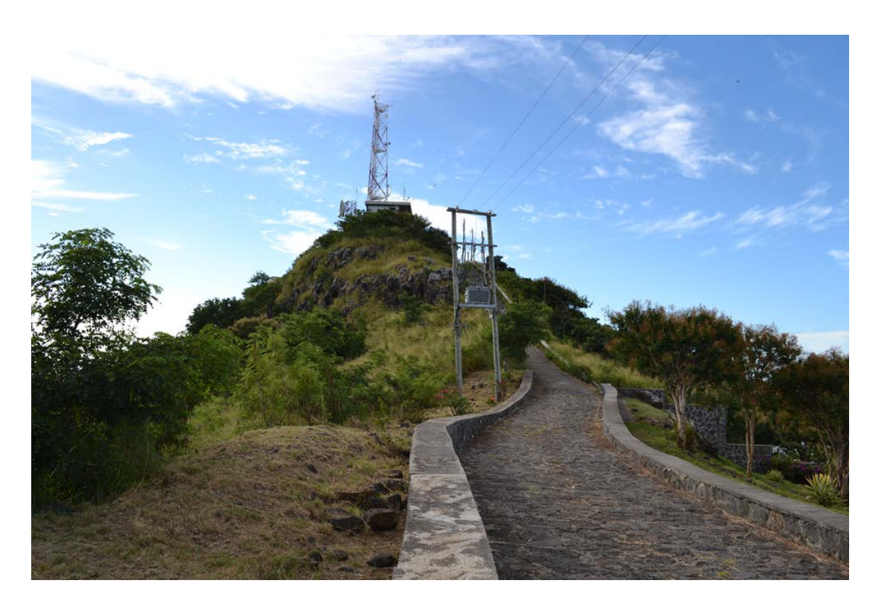
The Ministry of Environment and Sustainable Development