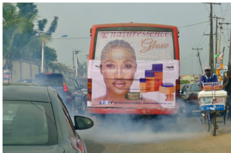
High levels of pollution