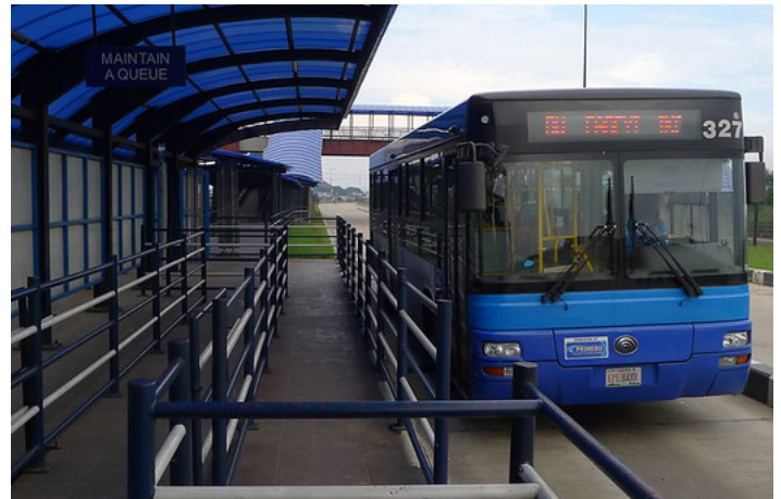
A BRT station in Lagos