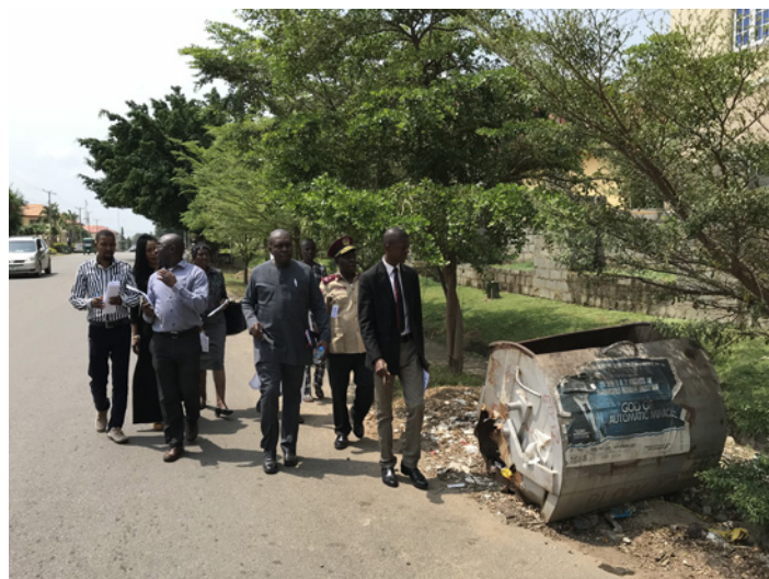
Stakeholders taking part in a site visits in urban areas in Nigeria

The Oct 2018 workshop was organised to present the draft Lagos NMT Policy and gather feedback from stakeholders. The event brought together representatives from government, elected bodies, academia, the private sector and civil society organisations. Participants gave their consent to move forward with adoption of the NMT Policy. As the next step, the draft Policy will be sent to the Executive Council for consideration and approval. Laws and regulations will be derived from the policy document by legal representatives of MOT and Ministry of Justice (MOJ). The Policy will then go to the House of Assembly for final review and approval.