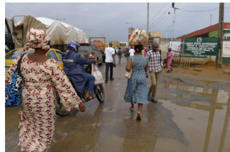
Lack of storm water drainage