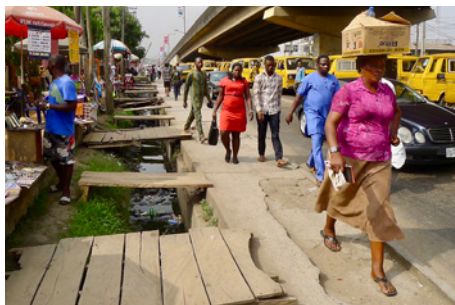
Risky open drains