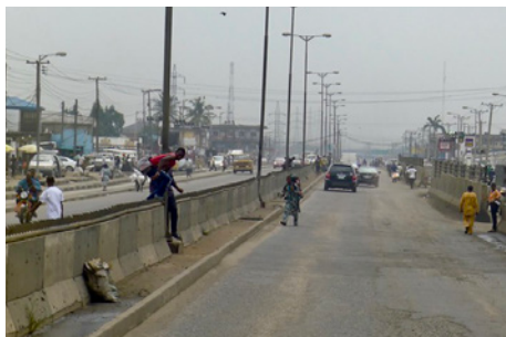
Lack of pedestrian crossings