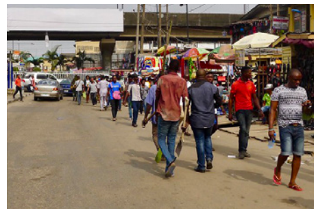
Streets lack separate space for walking