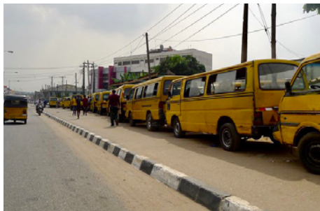
Poor parking management