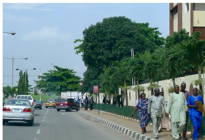
A footpath in Lagos

The Lagos State and Federal NMT Policies outline a number of initiatives to develop transport systems and urban plans that are socially inclusive and environmentally friendly. These include: