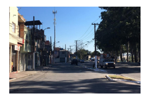
Lack of activity on the streets