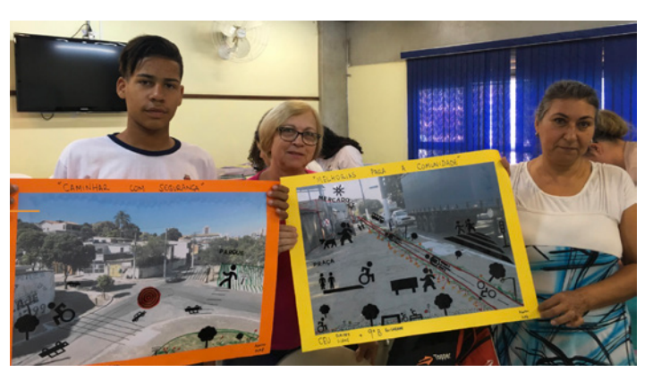
Participant proposals for the site