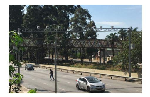
Pedestrians avoid using footbridges