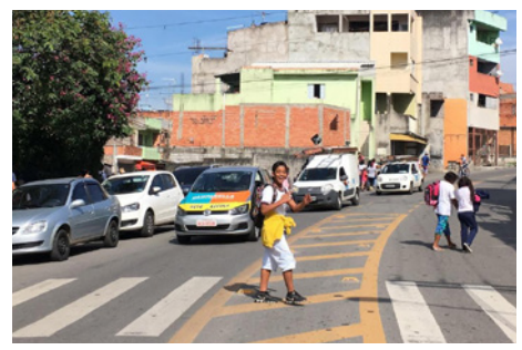
Need for safe at-grade crossings