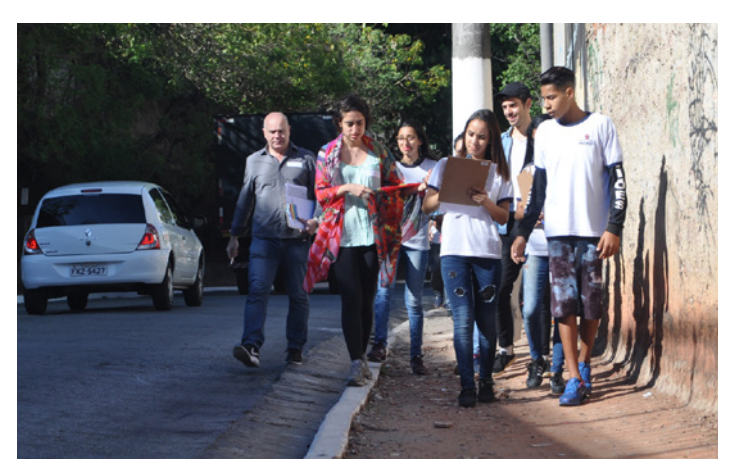
A site visit in São Paulo, Brazil