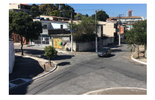
Wide intersections increase speed