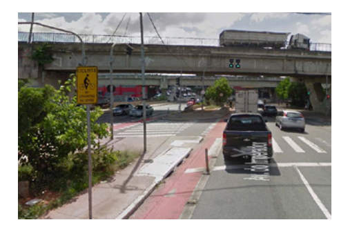
Lack of connectivity to public transport