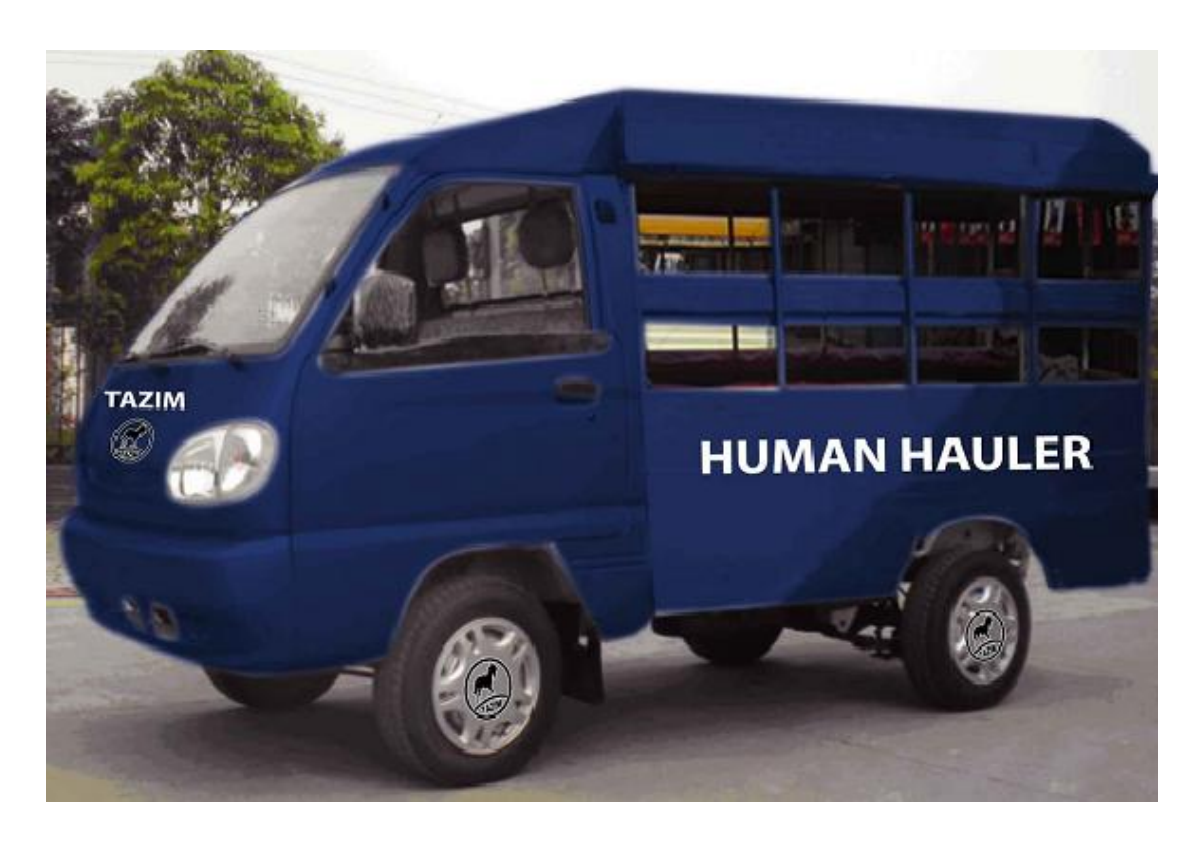
A typical "Human Hauler"

The vehicle described as a "Human Hauler*" may not be a term familiar to anyone outside of Bangladesh, but it is best described as a converted open truck that carries people.