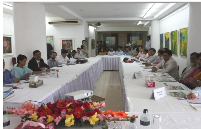
The audiences of the Inception Workshop were from universities, national and multi-national companies, government organizations like BSTI, BCSIR, and Department of Environment