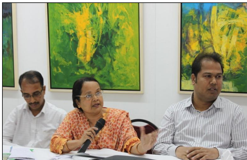
An official of Bangladesh Standard & Testing Institute (BSTI) actively attended the Open Discussion session