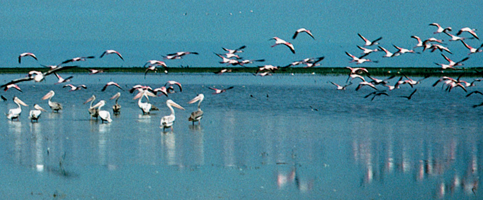
Wild Birds resting on Chale Swamp Lake near Dodoma.