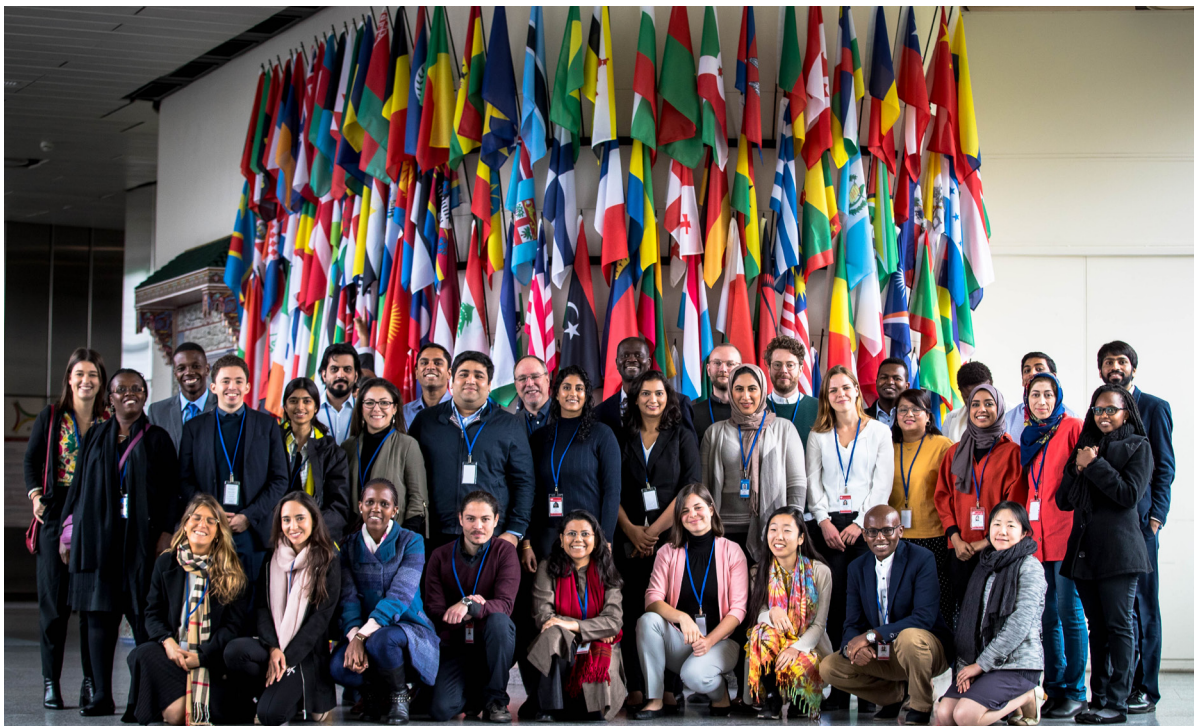
Group Photo of GEO for Youth Participants