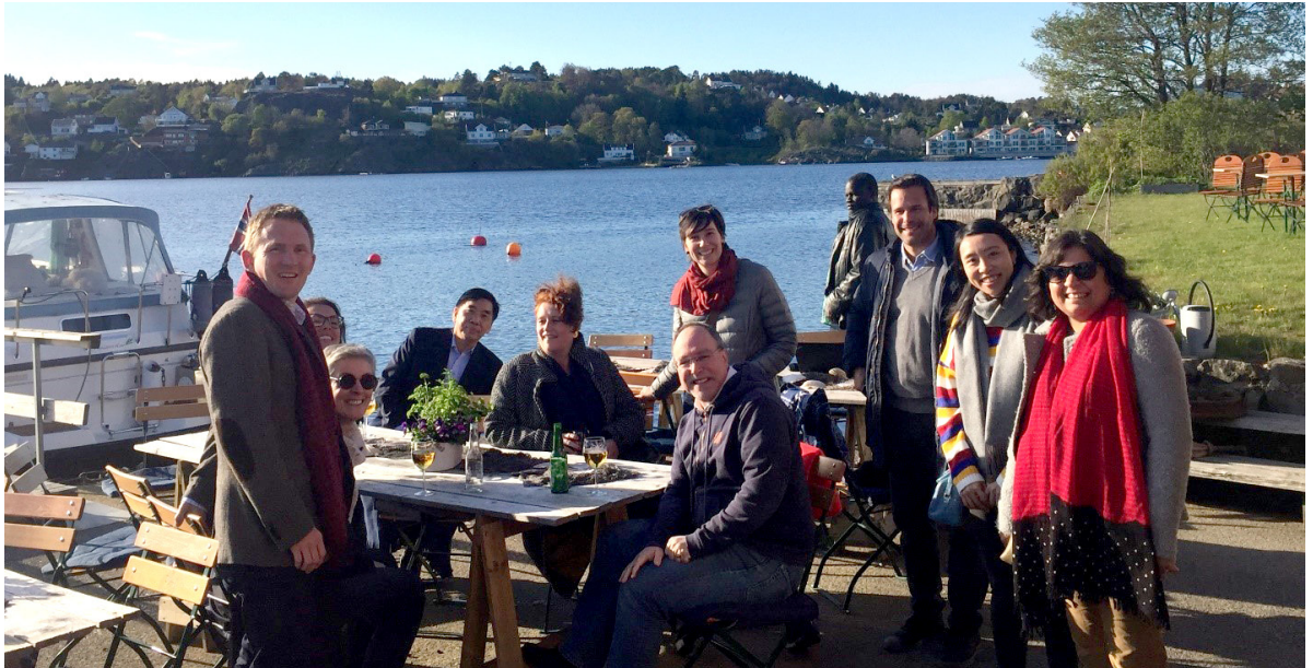
Participants of the GEO for Cities Meeting

The group then gave some comments on outreach and timeline. The Advisory Committee suggested that GEO for Cities could be launched on October 2020 during Convention on Biodiversity Diversity (CBD) and the timeline would extend a little bit longer following this schedule. The first authors meeting would move to late August 2019 to have more time for choosing authors. It was agreed that Advisory Committee would be involved in the internal review period and join the second authors meeting. The Secretariat will address all the comments and share the revised timeline after the meeting.