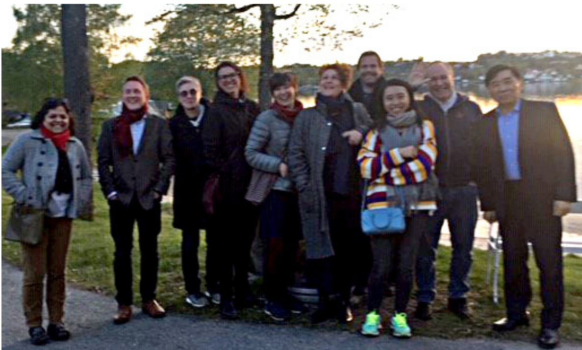
Participants at the Inception Meeting

The group emphasized that the target audience should be clear, although local government plays the main role in city issues, national governments could also be considered. Also, it was agreed that GEO for Cities should be different from other assessments. More information could be built on biodiversity issues since most assessments focus more on climate change. Planetary boundaries, infrastructure development, changes in social behaviours, economic growth, inequality are all the drivers of environmental issues in cities and could be added to supplement GEO-6. Thereafter, the Co-Chairs led a brainstorming discussion on target audiences, approach and scope/niche to move the process forward.