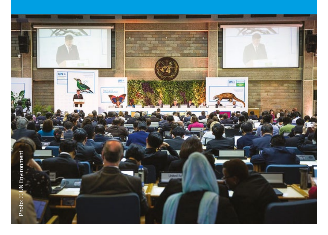
The UN Environment Assembly was created in June 2012, and embodies a new era in which the environment is at the centre of the international community's focus, and is given the same level of prominence as issues such as peace, poverty, health and security.

The universal 'parliament for the environment' brings together all 193 United Nations Member States, as well as representatives from civil society and the private sector. It is the world's highest-level environmental decision-making body and meets biannually in Nairobi. The Assembly sets the global environmental agenda and agrees on joint priorities and action to tackle the most pressing environmental challenges. We, the UN Environment Programme, host the UN Environment Assembly – this is what we call our unique convening power.