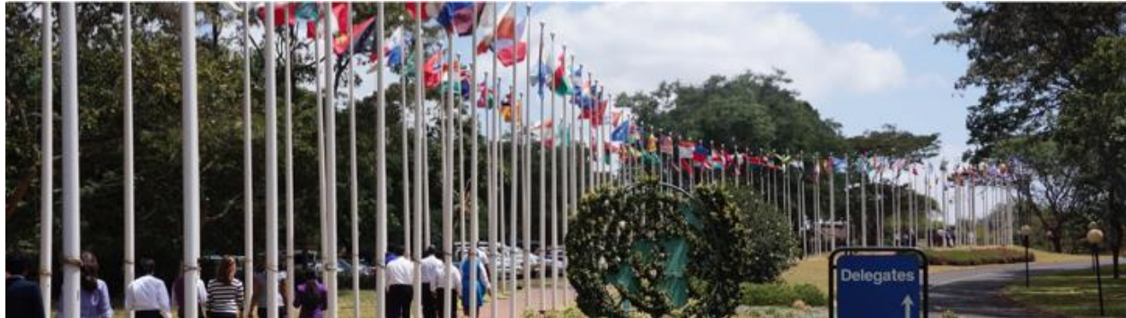
Above: The flags of member states at United Nations Nairobi.

The final draft of the Ministerial Declaration is now also available to view.