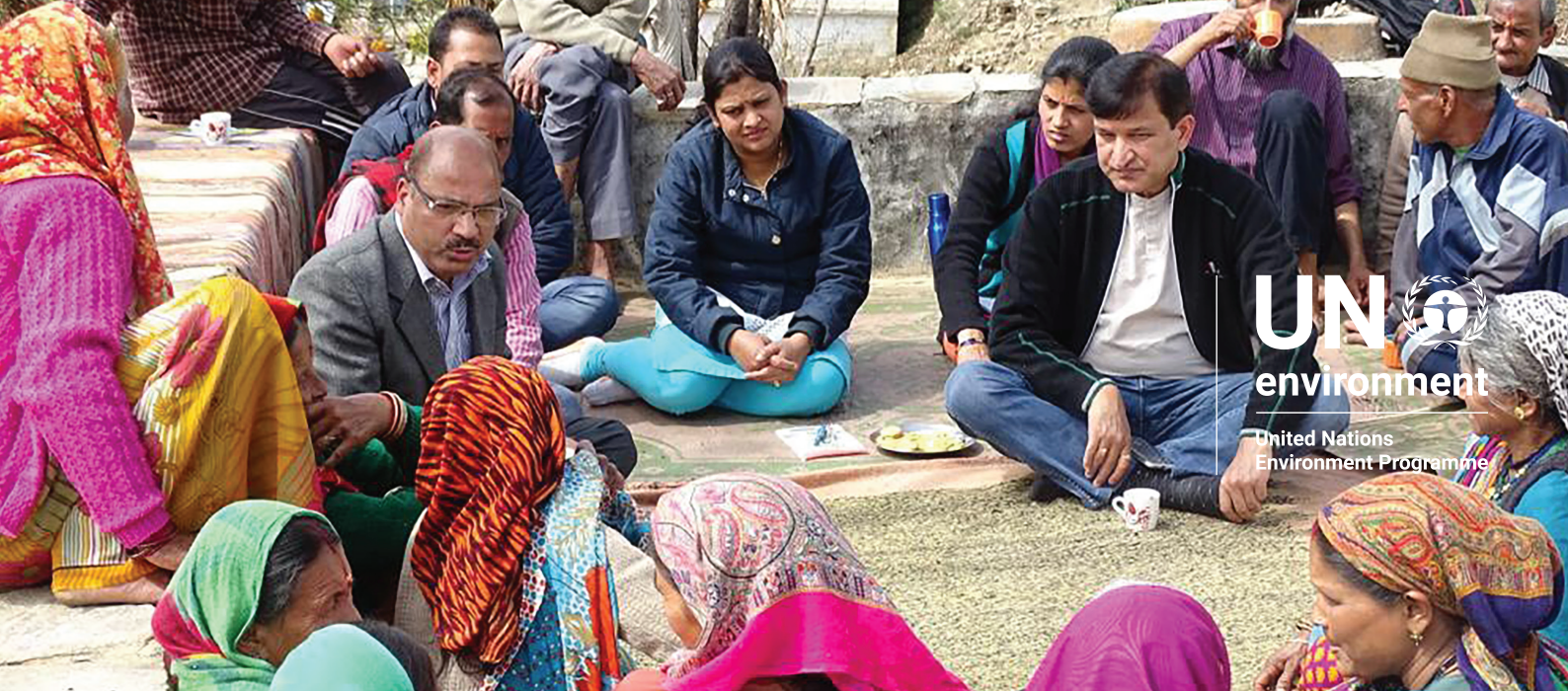
Local Group Discussion for baseline data collection