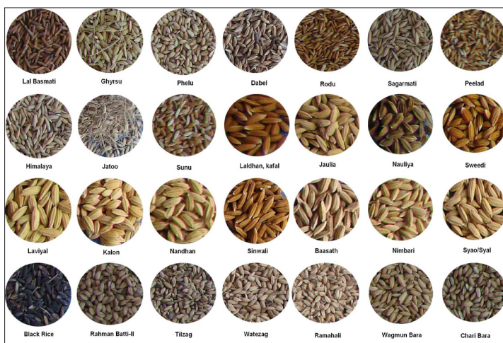
Rice genetic diversity collected from project sites