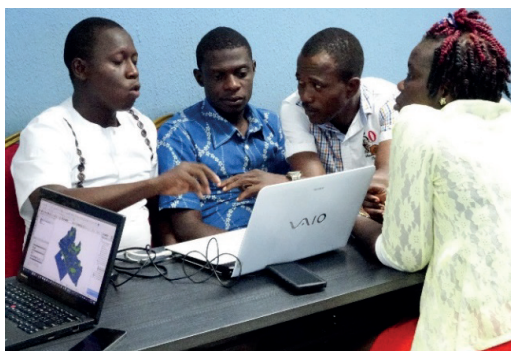
Above: Participants in training events on spatial analyses for REDD+ planning in Liberia and Viet Nam.

Below: Countries participating in REDD+ readiness, through membership of the UN-REDD Programme, Forest Carbon Partnership Facility or both. Due to wide participation among developing countries rich in biodiversity, initiatives to support integration of REDD+ planning with other goals have great potential for synergies with the Sustainable Development Goals and Aichi Biodiversity Targets.