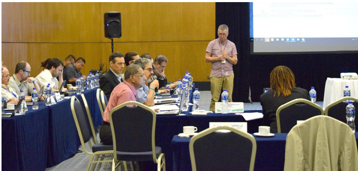
A session of the Drafting Meeting in Progress

Along with the main draft Summary for Policy Makers a two-page draft Summary for Ministers was prepared and agreed by the High-level Group. Co-chairs of the assessment, co-chairs of the Scientific Advisory Panel and authors were given one week to verify any line of sight issues between the new draft of the Summary for Policy Makers , the draft Summary for Ministers and the main Global Environment Outlook report. Any line of sight issues identified by the co-chairs or authors was presented to the High-level Group for approval. Copy and science editing will be performed on the draft Summary for Policy Makers and Summary for Ministers before they are translated for Member States.