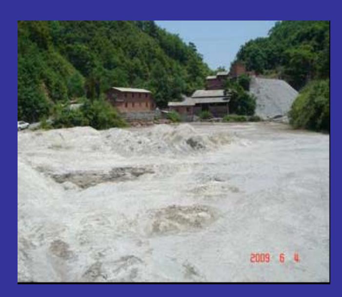
Tailing wastes 尾砂库