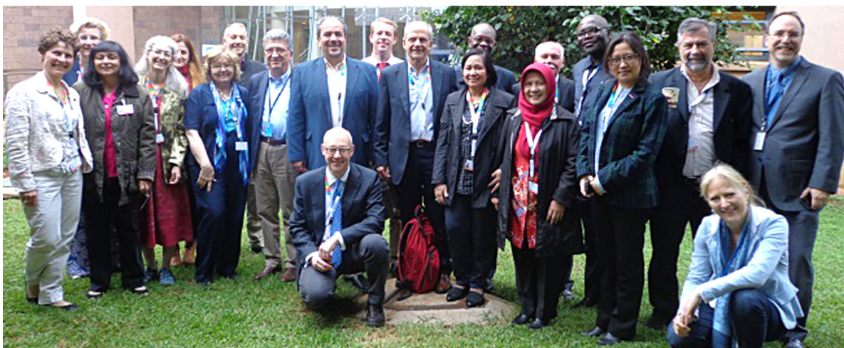
Some members of the High-Level Group

Members of the High-level Group who are stakeholders will have the same standing as members from governments. A group of up to 25 Authors and the assessment Co-chairs and vice-chairs of the assessment, as well as the co-chairs of the Scientific Advisory Panel, will be present at the meeting to offer support to the High-level Group members during the drafting process. Only those authors that are needed for a particular section of the drafting of the Summary for Policy Makers should be present in the plenary. Authors should rotate through the plenary room as their sections of the Summary for Policy Makers are presented for discussion.