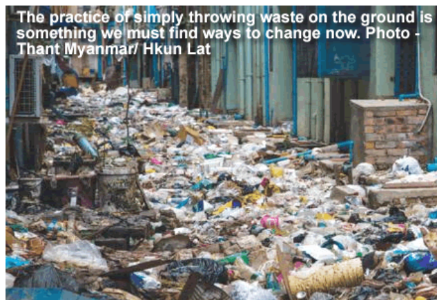
The practice of simply throwing waste on the ground is something we must find ways to change now.

I visited Myanmar and I loved the place, the nature, the art and the people of the country. The valley of Bagan, with all its wonderful temples is probably the most stunning place I have visited in my entire life. From the 9th to the 13th century, Bagan was the capital of the Pagan Kingdom, which was the first to unify the regions that would later constitute modern Myanmar. Today, Bagan is one of the world's greatest archaeological sites. The setting is wonderful, a 67 square-mile valley, partly covered with palms and tamarind, crossed by the Irrawaddy river. Of the original 4,450 temples, 2,230 still survive today. The United Nations Educational, Scientific and Cultural Organization restored and still preserves most of them, trying to maintain the different examples of temples and stupas found in the valley. Most of the tourists visit the valley riding a bike or a motorbike, which allows them to explore the area without following the main road, just following the sand paths which brings them to the smallest temples or next to the cultivated lands.