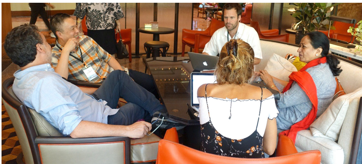
Drafting session of the Drivers Chapter