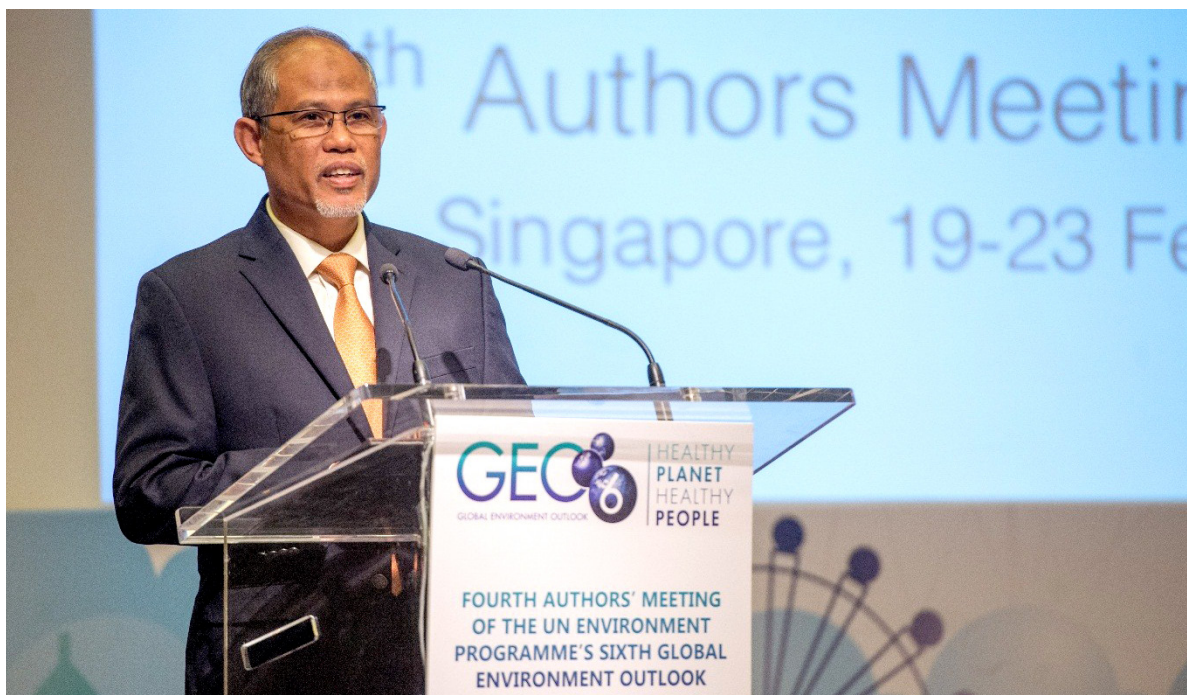
Minister Masagos Zulkifli of the Ministry of Environment and Water Resources of Singapore during the opening ceremony

The highly anticipated and final author's meeting of the sixth edition of the Global Environment Outlook was held at the Regent Four Seasons Hotel in Singapore from 19-23 February 2018. The meeting was co-organized by the Ministry of Environment and Water Resources of Singapore and UN Environment. The meeting covered a full five days, with opening ceremonies, an outreach event and planning meetings for authors and fellows on the first day and an Outlooks visioning workshop and a field trip on the third day.