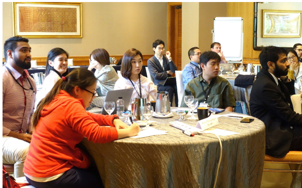
Ongoing session of the First Authors' Meeting of the Sixth Global Environment Outlook for Youth, Asia-Pacific