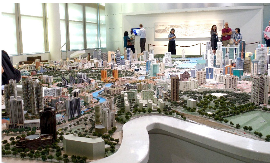
Participants during a tour of the Singapore City Gallery

The technical review of the full sixth edition of the Global Environment Outlook will begin on 16 April 2018, which means all chapters must be delivered to the Secretariat in second-order draft form by 11 April 2018. The review comments will need to be addressed between 15 May and 15 June 2018 by the authors. Efforts are being made with the Review Editors to improve the efficiency and accuracy of the process of addressing review comments. A Science Editor will also be engaged to review the chapters from 15 April to 15 June to tighten up the narrative, propose improvements to the quality of the science and eliminate duplication in the document. The intergovernmental review is intended to begin on 15 June 2018, until 15 August 2018. The review comments from this