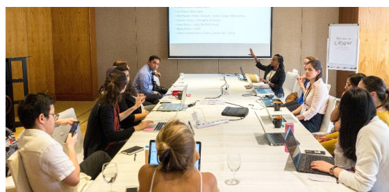
Planning meeting of the fellows