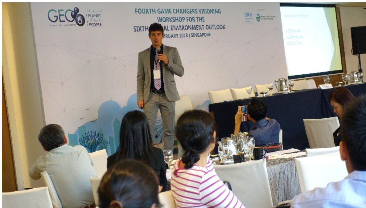
Presentation on the Global Environment Outlook for Cities