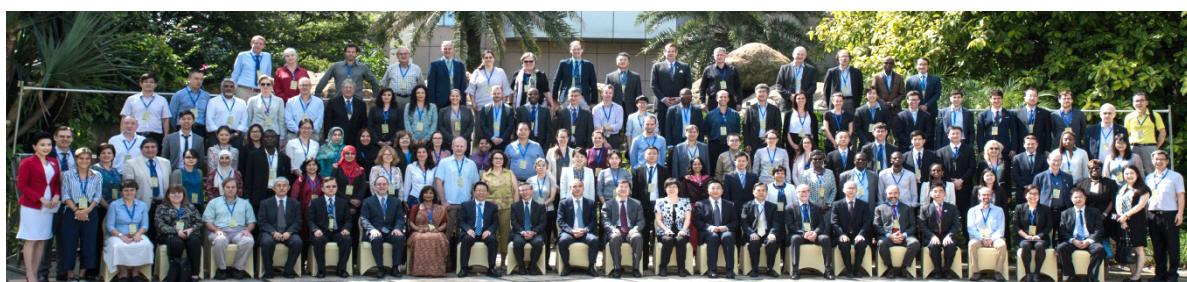
Participants of the third global authors meeting pose for a group photo at the Nansha Grand Hotel, Guangzhou, China.