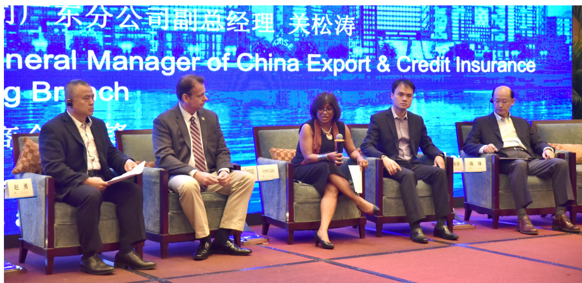
Panelists at the session

about thirty minutes beyond the scheduled time. The key recommendations of this event will serve as inputs for the UN Science-Policy-Business Forum, taking place in Nairobi from the 2-3 December 2017 leading up to the UN Environment Assembly, under the banner “Science for Green Solutions.”