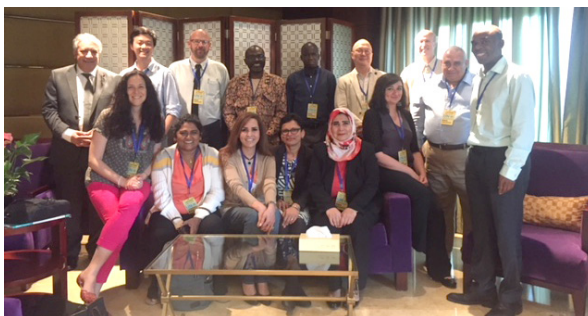
Review editors at one of the sessions