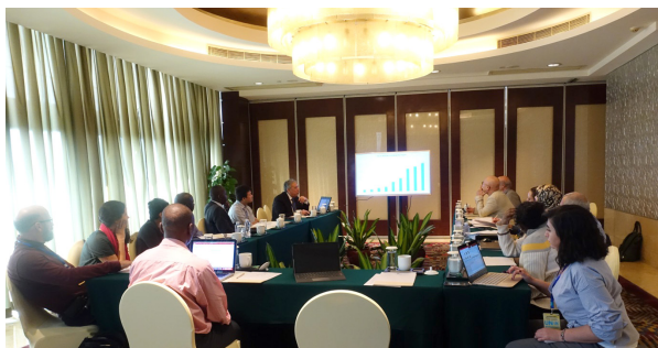
Review Editors at the Guangzhou meeting