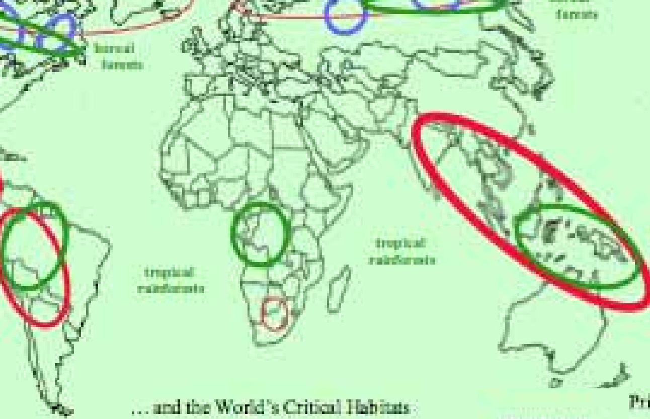
... and the World's Critical Habitats