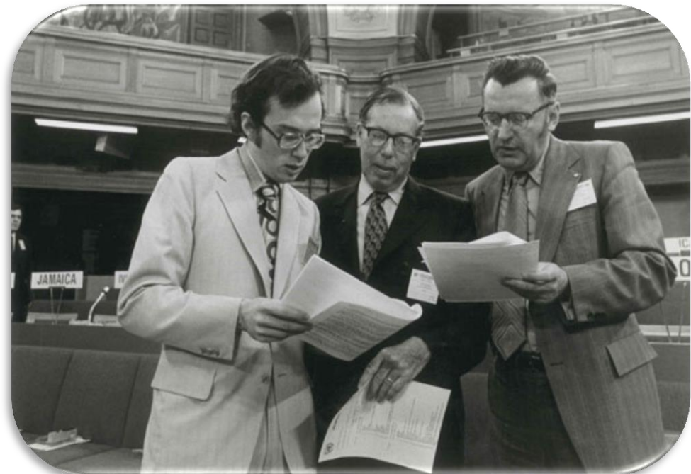
Delegates discussing a document at the Conference (1972)