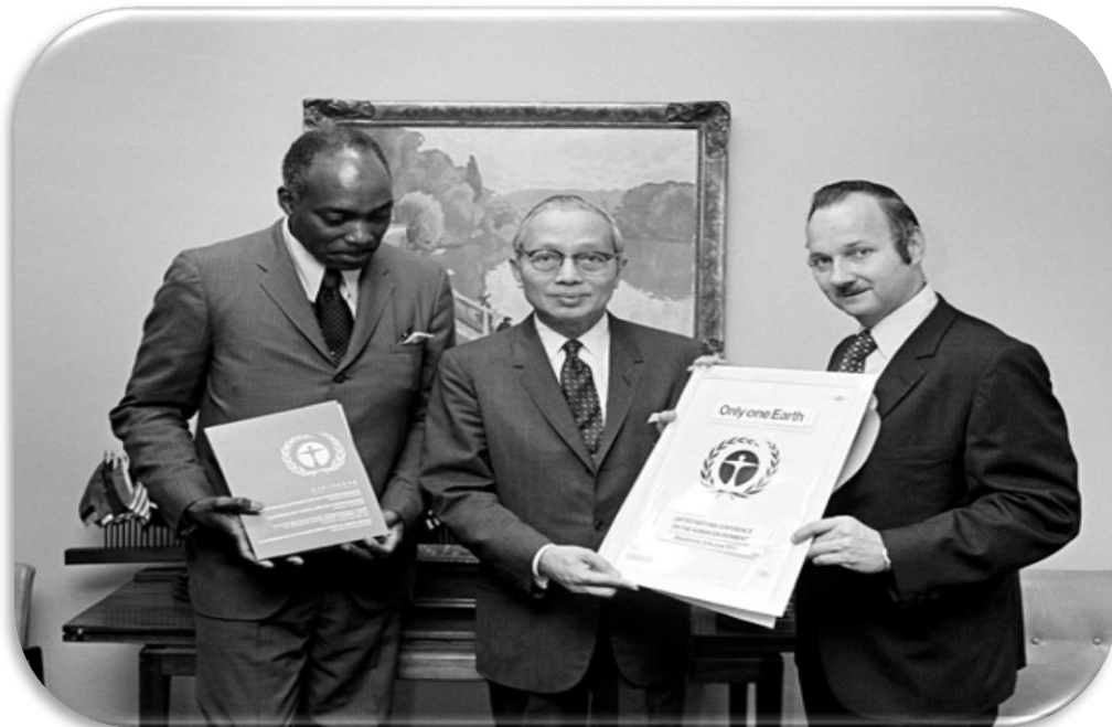
Presentation of Stockholm Conference Poster to Secretary-General U Thant (1971)

“To provide leadership and encourage partnership in caring for the environment by inspiring, informing, and enabling nations and peoples to improve their quality of life without compromising that of future generations”.