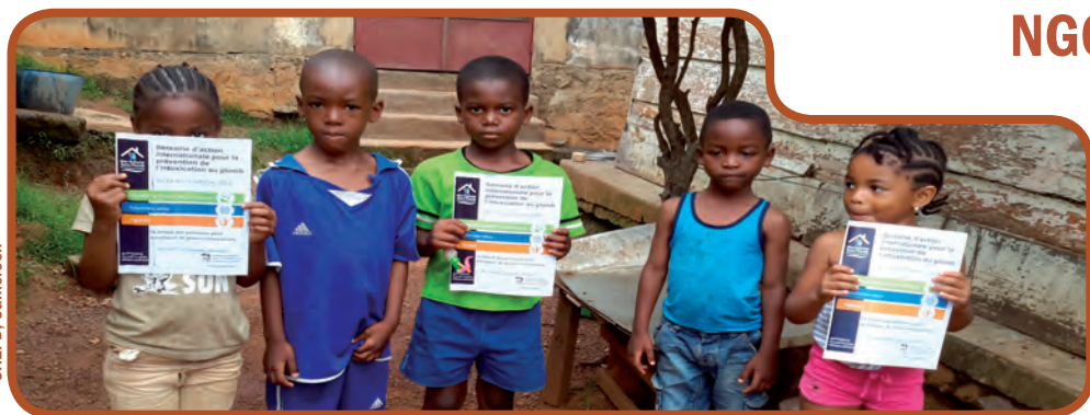
International Lead Poisoning Prevention Week in Cameroon