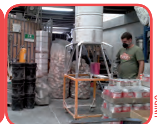
Paint Manufacturer in Colombia

United Nations Industrial Development Organization (UNIDO) joined the Lead Paint Alliance in 2014. It works closely with National Cleaner Production Centres and national governments towards the phase-out of lead in paint. It is developing a project in Bolivia, Ecuador, Colombia and Peru to assist governments and industry to introduce legal limits to lead in paint and apply best available technologies.