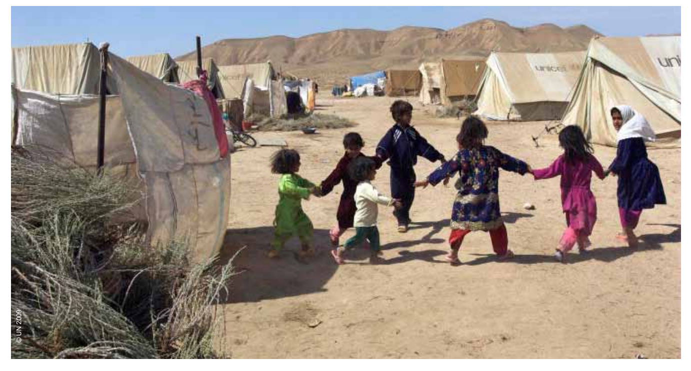
Children Play at Sosmaqala IDP Camp in Afghanistan

The national authorities outlined four general contexts where the environment and humanitarian nexus needs to be better understood: Refugees and IDPs in informal settlements on forested public land; Pakistani refugees in camps; Afghan refugee returnees settling in Kabul and other towns contributing to urban sprawl; and Afghan refugee returnees formally resettled in new settlements.<sup>6</sup>