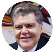
José Sarney Filho

Brazil is focused on curbing deforestation in the Amazon.