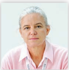
Mette Wilkie Director Ecosystems Division United Nations Environment Programme

Above all, the Action Plan will complement national and regional sustainability agendas; the achievement of the 2030 Agenda on sustainable development and the Sustainable Development Goals (SDGs); the African Agenda 2063; and the UNESCO Global Action Plan for Education for Sustainable Development.