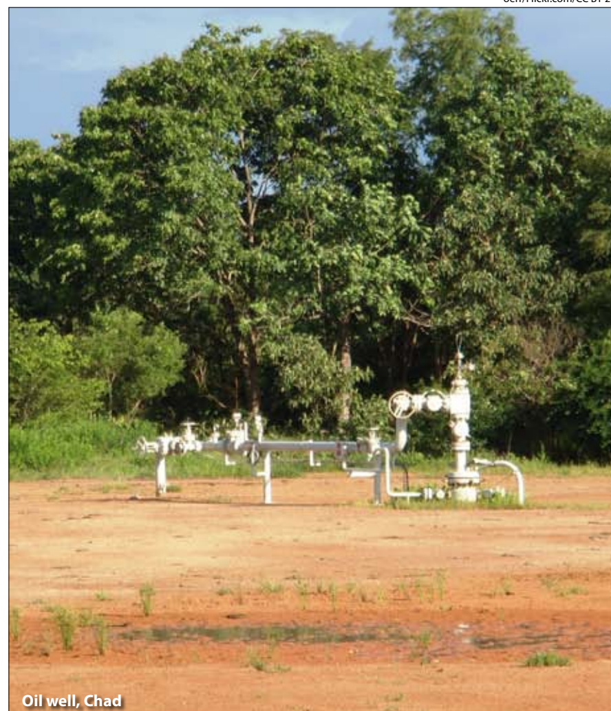
Oil well, Chad