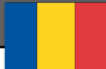
Figure 1: Energy profile of Chad