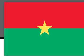
Figure 1: Energy profile of Burkina Faso