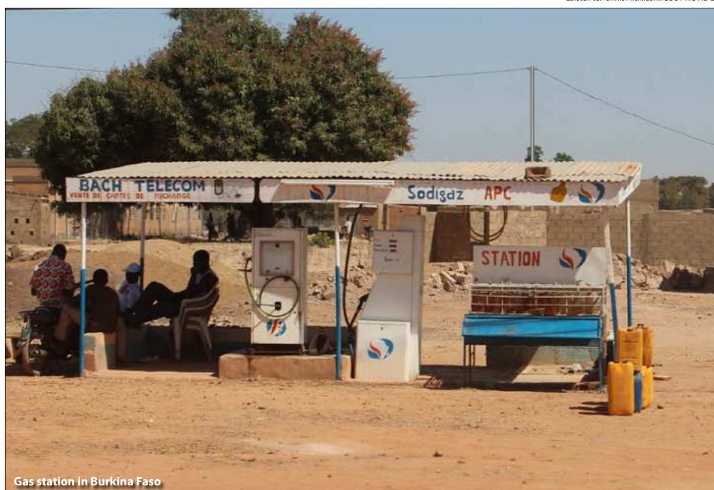
Gas station in Burkina Faso