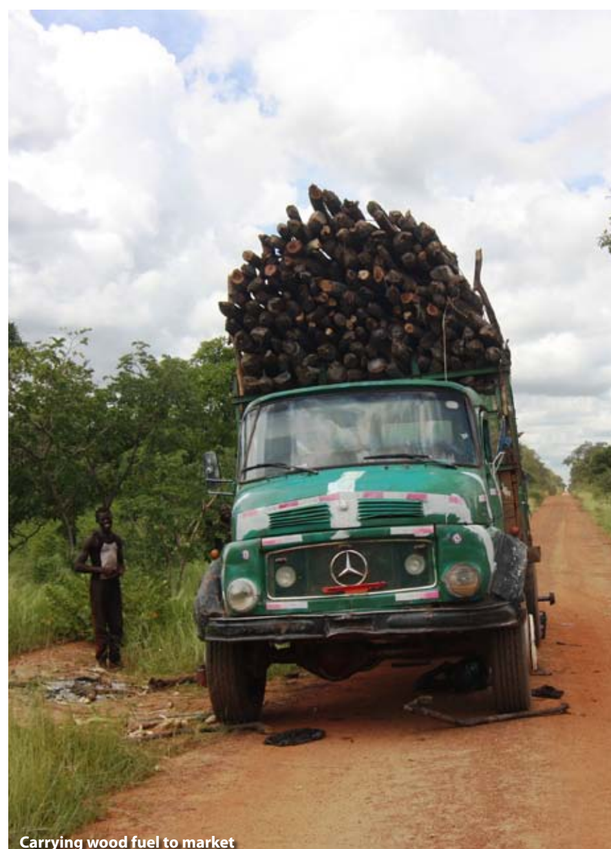
Carrying wood fuel to market