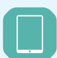
notepads and tablets