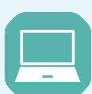
laptops and PCs