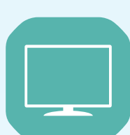
TVs and screens