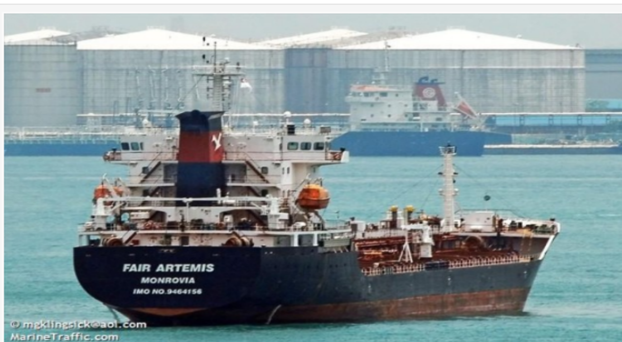
MT Fair Artemis.