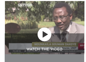
Regional Director on WED