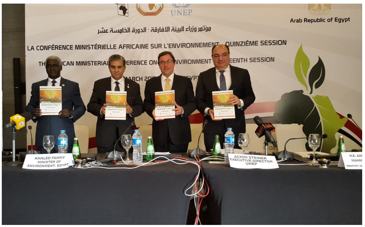
Left to right: AMCEN President, Minister of Environment, Egypt, UNEP Executive Director, Ambassador /PR of the Arab Republic of Egypt to UNEP