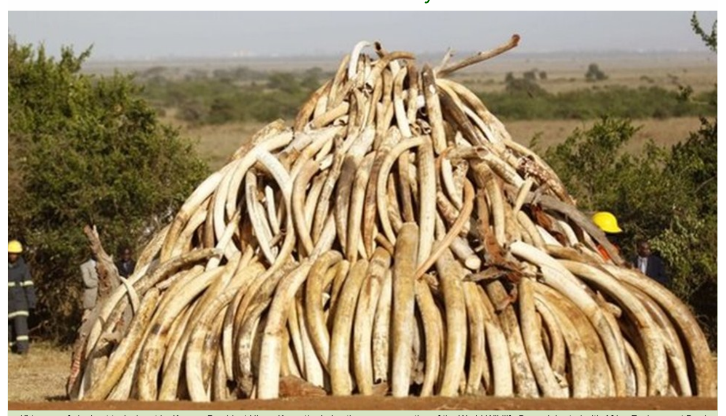
15 tonnes of elephant tasks burnt by Kenyan President Uhuru Kenyatta during the commemoration of the World Wildlife Day celebrated with Africa Environment Day/ Wangari Maathai Day

he President of the Republic of Kenya, Uhuru Kenyatta graced the celebrations with the torching of 15 tonnes of contraband ivory at the Nairobi National Park as a fight against illegal wildlife trade and its products. The theme for WWD day was "Wildlife Crime is serious, let's get serious about wildlife crime". The ceremony jointly organized by UNEP, African Union Commission (AUC), The government of Kenya and Kenya Wildlife Service (KWS), brought together more than 1,000 guests among them, H.E Tumusiime Rhoda Peace, African Union Commissioner for Rural Agriculture and Economy-, a number of Kenyan Cabinet Secretaries, the United Nations and Members of the international and diplomatic community.