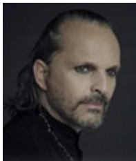
Miguel Bosé , Singer and environmentalist

For the past 30 years Miguel Bose has been a major force in Latin Music, crossing all genres but always maintaining an electronic beat. He grew up with Picasso and Ernest Hemingway, who were family friends. In 2007 to