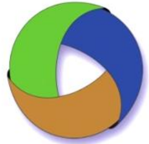
Republic of Iraq