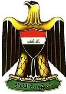
Republic of Iraq