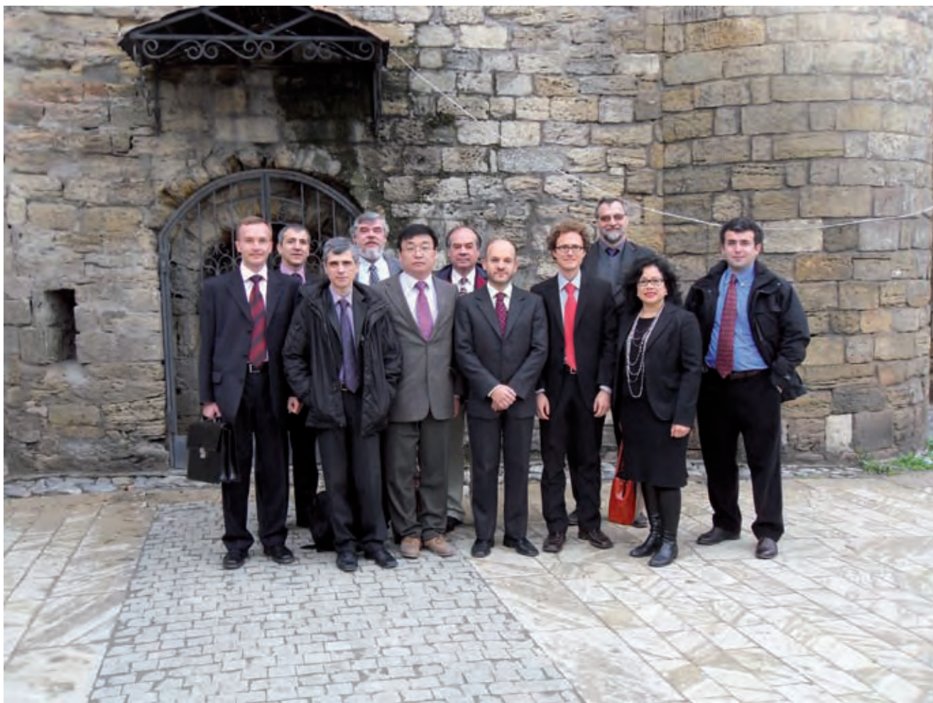
Team of experts for the second EPR of Azerbaijan, 2010