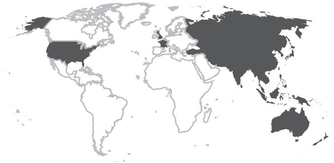
The shaded areas of the map indicate ESCAP members and associate members.

ESCAP is the regional development arm of the United Nations and serves as the main economic and social development centre for the United Nations in Asia and the Pacific. Its mandate is to foster cooperation between its 53 members and 9 associate members. ESCAP provides the strategic link between global and country-level programmes and issues. It supports Governments of countries in the region in consolidating regional positions and advocates regional approaches to meeting the region's unique socioeconomic challenges in a globalizing world. The ESCAP office is located in Bangkok, Thailand. Please visit the ESCAP website at www.unescap.org for further information.