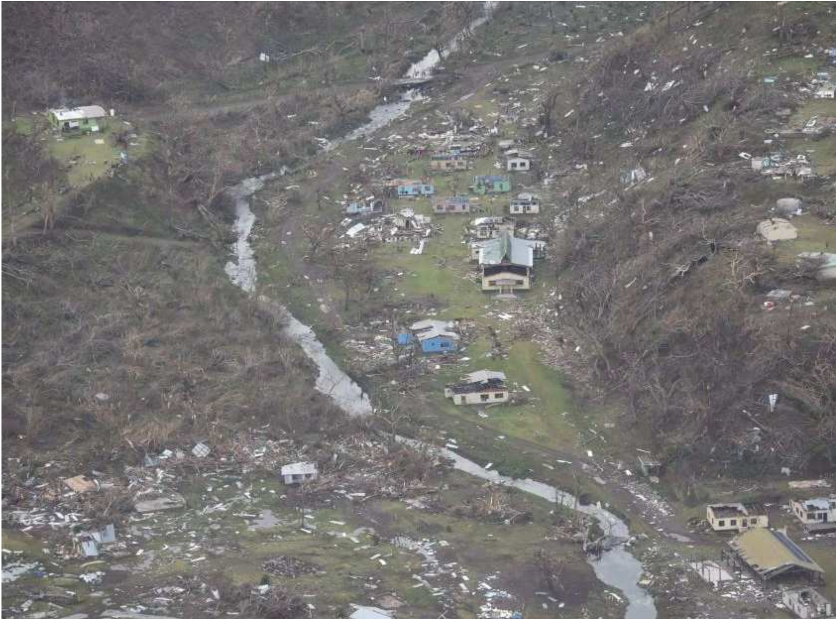
Aerial shot of damage caused by Cyclone Winston to Tavua in Northern Fiji.