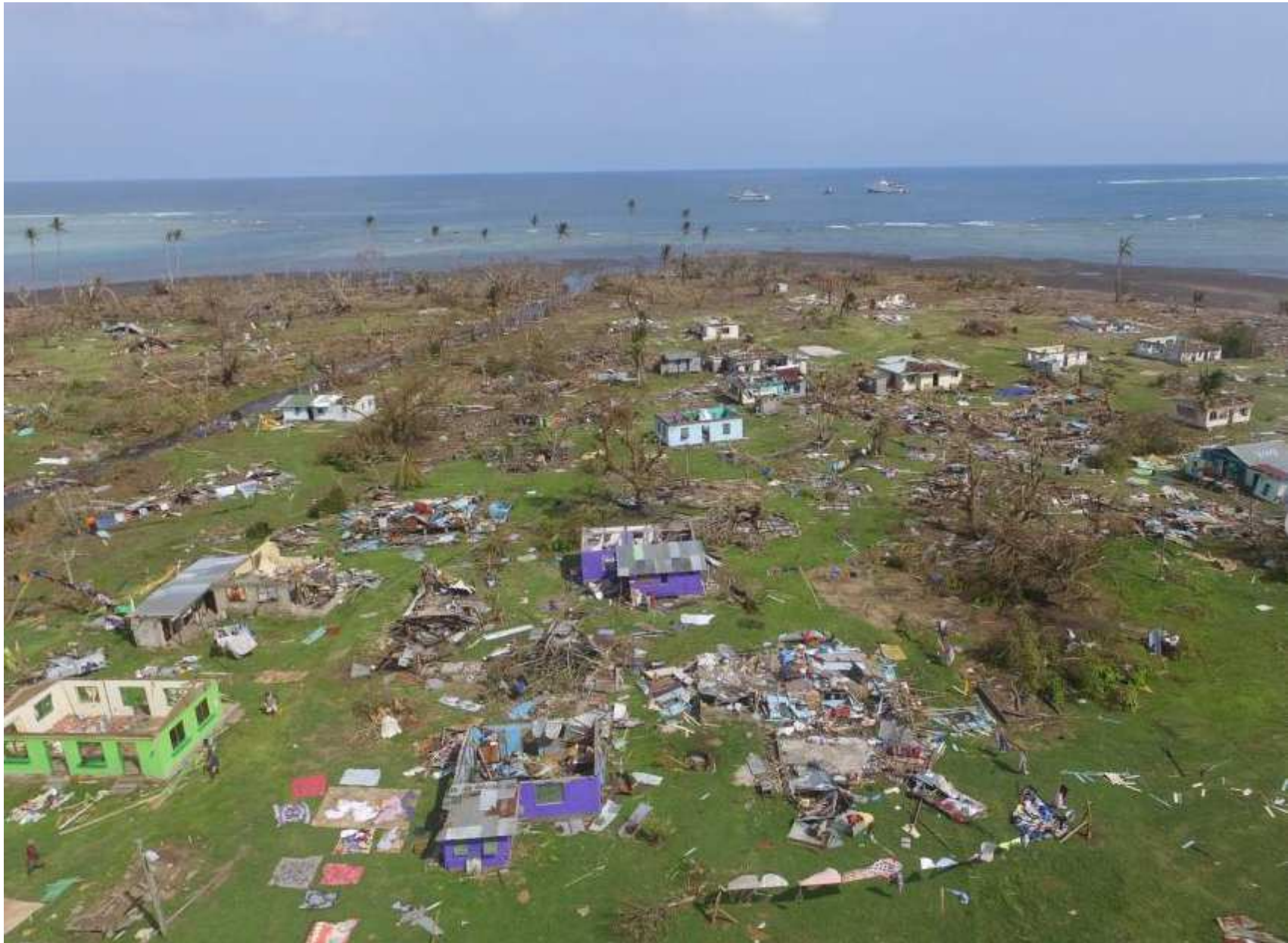
Houses destroyed by Cyclone Winston on Fiji's Koro Island.

7