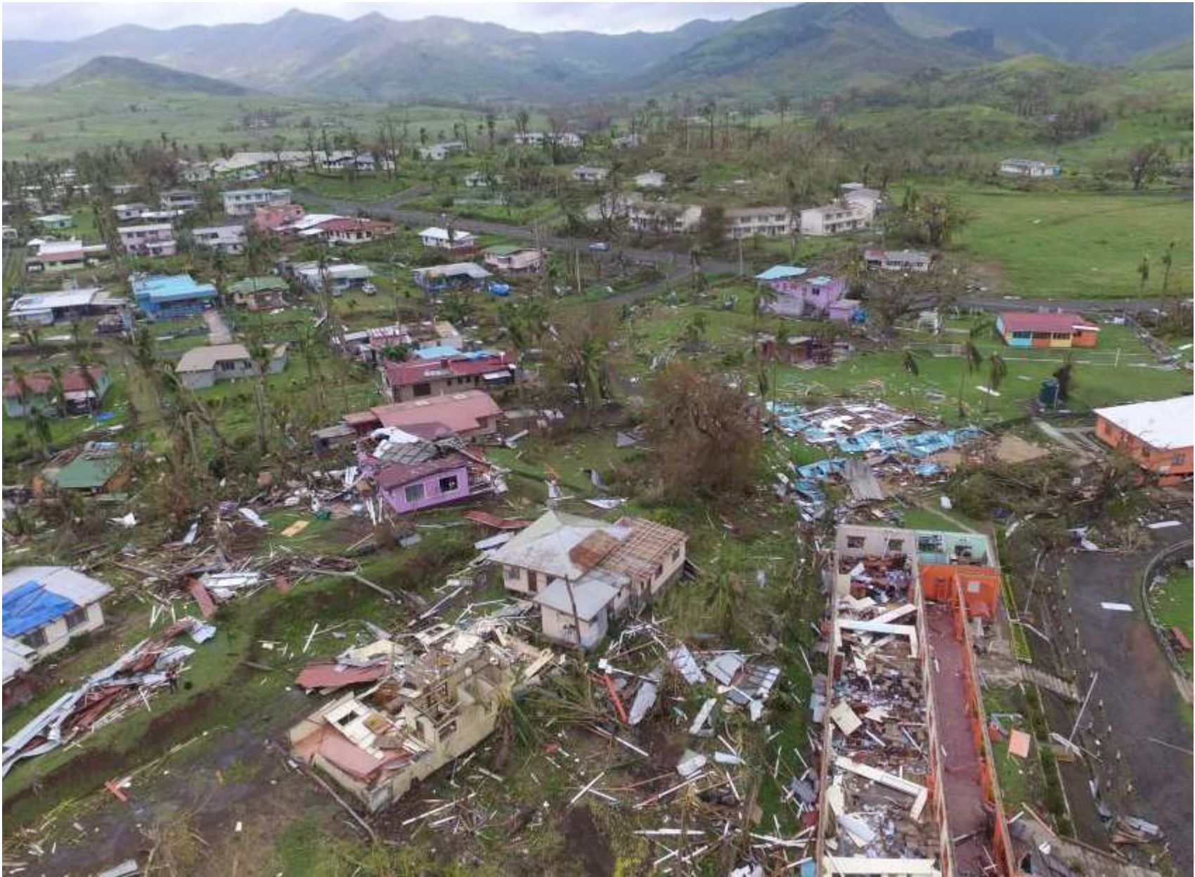
Damage to the town of Rakiraki in Fiji's Ra Province.

6