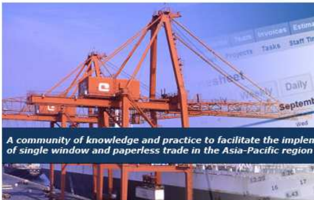
A community of knowledge and practice to facilitate the implementation of single window and paperless trade in the Asia-Pacific region