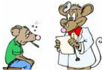
Sickness / ill health