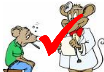
Sickness / ill health